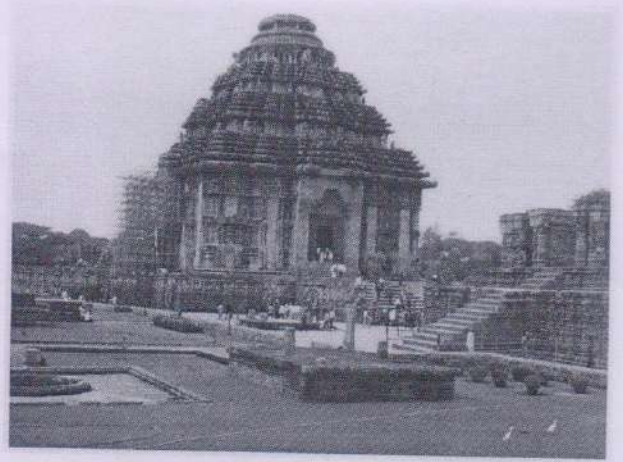
SUN TEMPLE - ODISHA